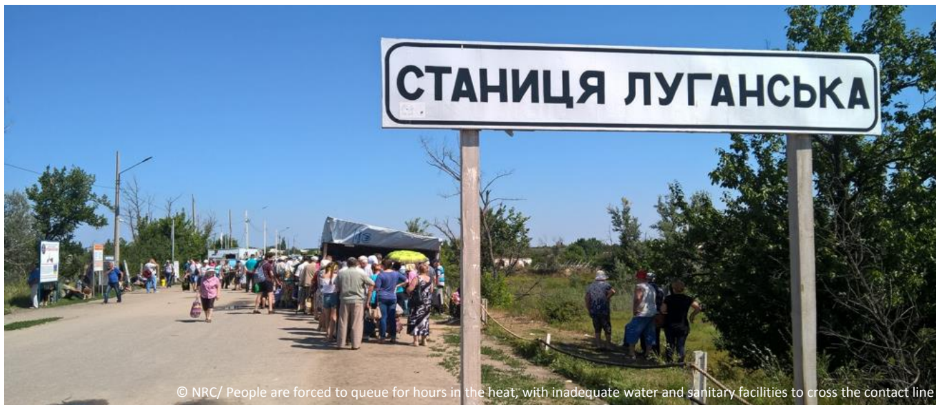
People are forced to queue for hours in the heat, with inadequate water and sanitary facilities to cross the contact line

THE PROTECTION CLUSTER INCLUDES SUB-CLUSTERS ON CHILD PROTECTION, GENDER BASED VIOLENCE AND MINE ACTION