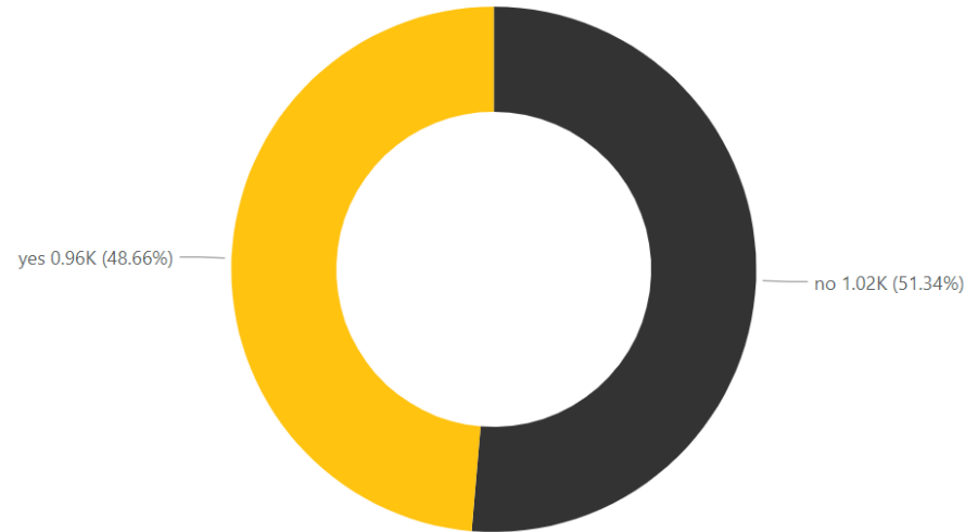
Lacking birth registration (48.66%):Yes – (51.34%): No