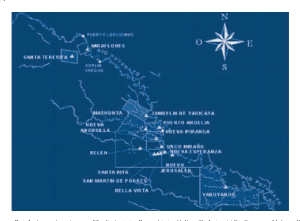
Map 1. The titled native communities in the Teniente Manuel Clavero District

Source: Detail adapted from the map "Territorio de las Comunidades Nativas Tituladas del Río Putumayo", Information System on Native Communities of the Peruvian Amazon (SICNA), Instituto del Bien Común (April 1998). The map was adapted to the actual ubication of the communities of Bellavista, San Martín de Porres and Santa Rita.