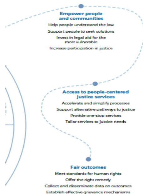
Graph: Objectives of legal aid interventions 40