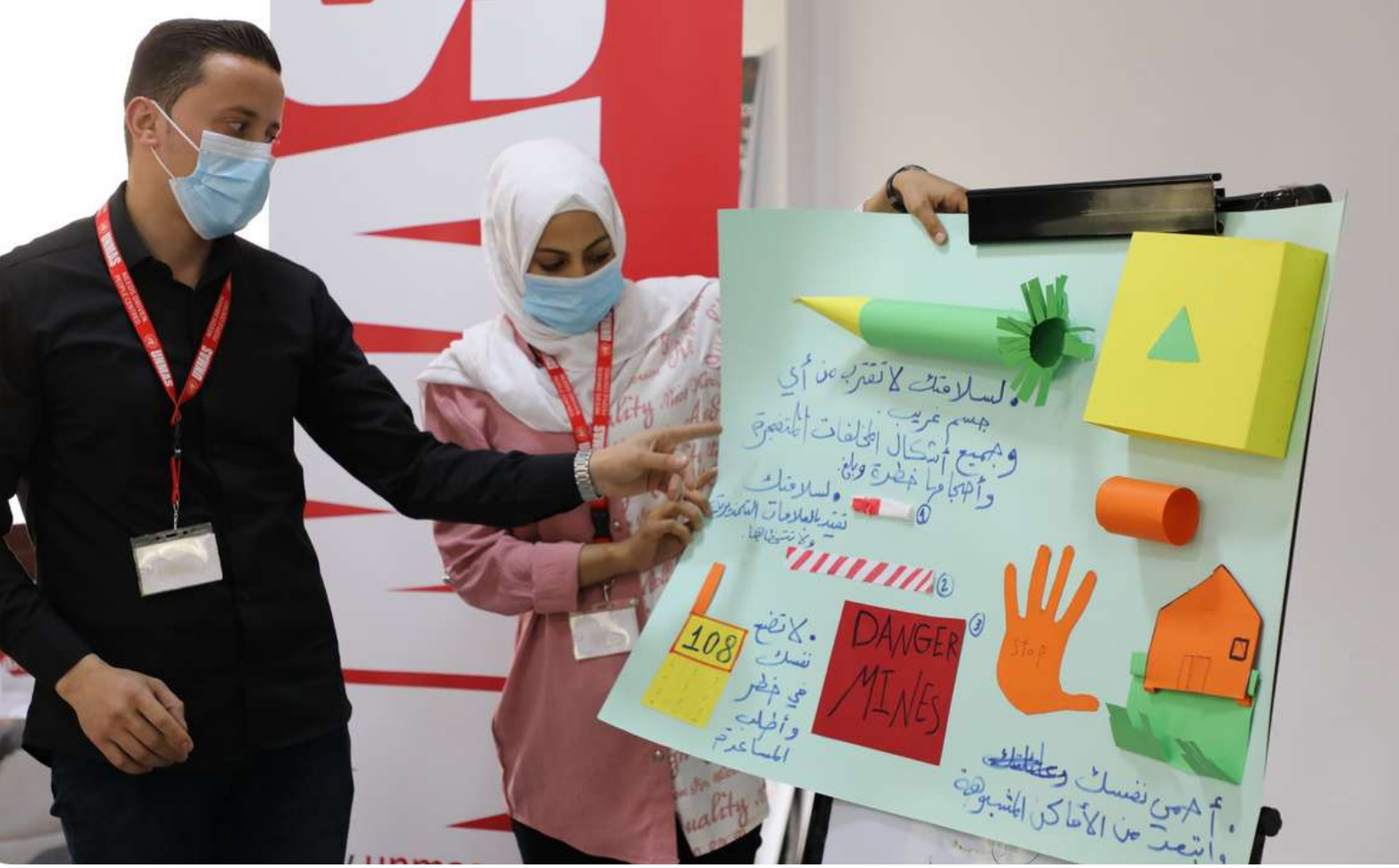
Explosive Ordnance awareness session with humanitarian colleagues in Damascus, Syria. November 2021.