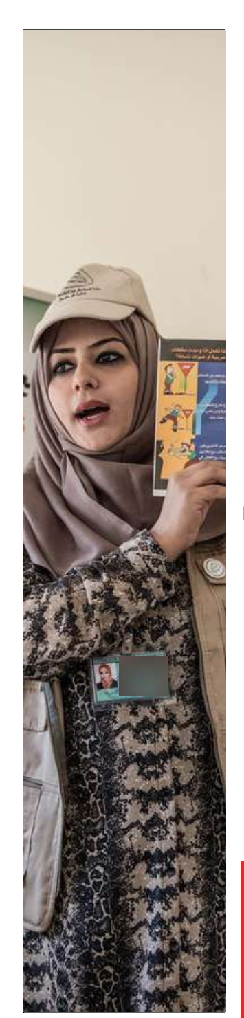
IHSCO conducts Risk Education in Iraq.

The MA AoR aims to promote Equality, Diversity and Inclusion (EDI) across its workforce and in relevant MA operations, with a particular focus on disability inclusion, gender and racial equity through an intersectional approach. This includes diversity-responsive and conflict-sensitive programming, so that the work delivered benefits the entire community and that it does not impact local power dynamics unknowingly or negatively. It also includes a diverse and inclusive workplace, promoting a work environment free from discrimination and improving the quality of work by offering a larger range of skills and perspectives. Additionally, at the global level, an overhaul of the governance and membership of the MA AoR especially for greater inclusion and diversity should be implemented. This work will be conducted in line with the United Nations Gender Guidelines for Mine Action Programmes, the International Convention on the Elimination of All Forms of Racial Discrimination, and other relevant guidelines.