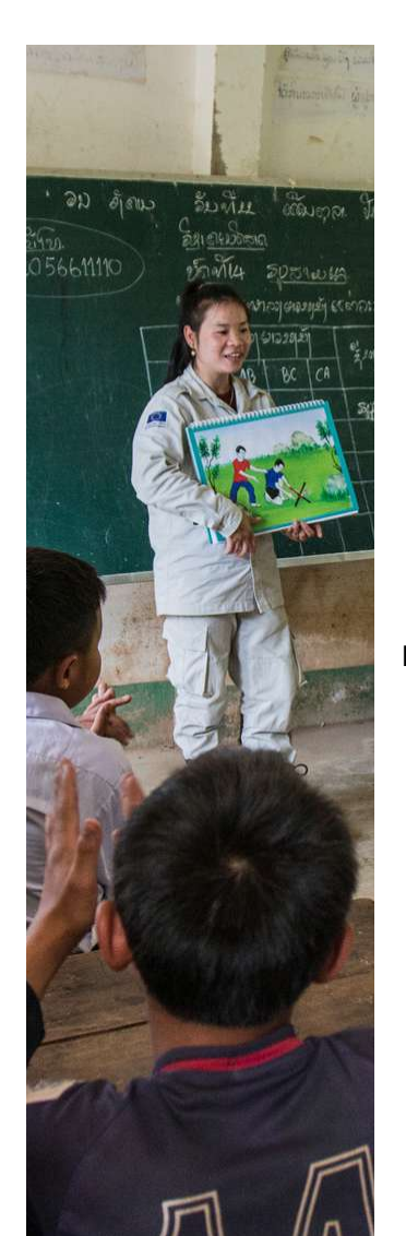
Risk Education in Laos.

In accordance with the IASC Guidance, the GPC and its four AoRs are seeking to promote strategies and coordination mechanisms that are: "as local as possible, as international as necessary." The global MA AoR promotes local ownership and transfer of capacities in mine action processes and empowers affected people by enhancing equitable and long-term partnerships with humanitarian mine action NGOs (both national and international) and national authorities with a clear focus on building in-country capacity. The MA AoR works with local and national actors, in particular women-led and youth-led organizations as well as persons with disabilities, aiming to facilitate their participation and representation in coordination structures for the overall benefit of affected people.