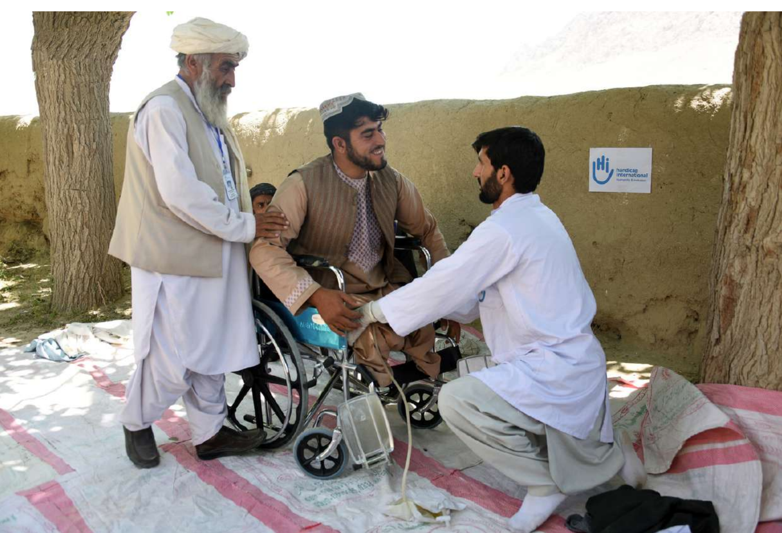
Victim Assistance in Afghanistan.