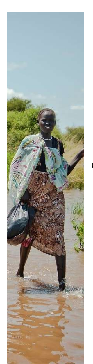
Climate Change: flooding.

From humanitarian emergencies all the way to post-conflict peacebuilding, humanitarian mine action, operationalized in a conflict-sensitive manner, is critical to peace and sustainable solutions. The global MA AoR champions durable solutions that meet protection standards through the nexus of humanitarian, peace and development action. Furthermore, the planet is faced with an unprecedented environmental emergency and the mine action sector has identified the need to develop stronger environmental practices.