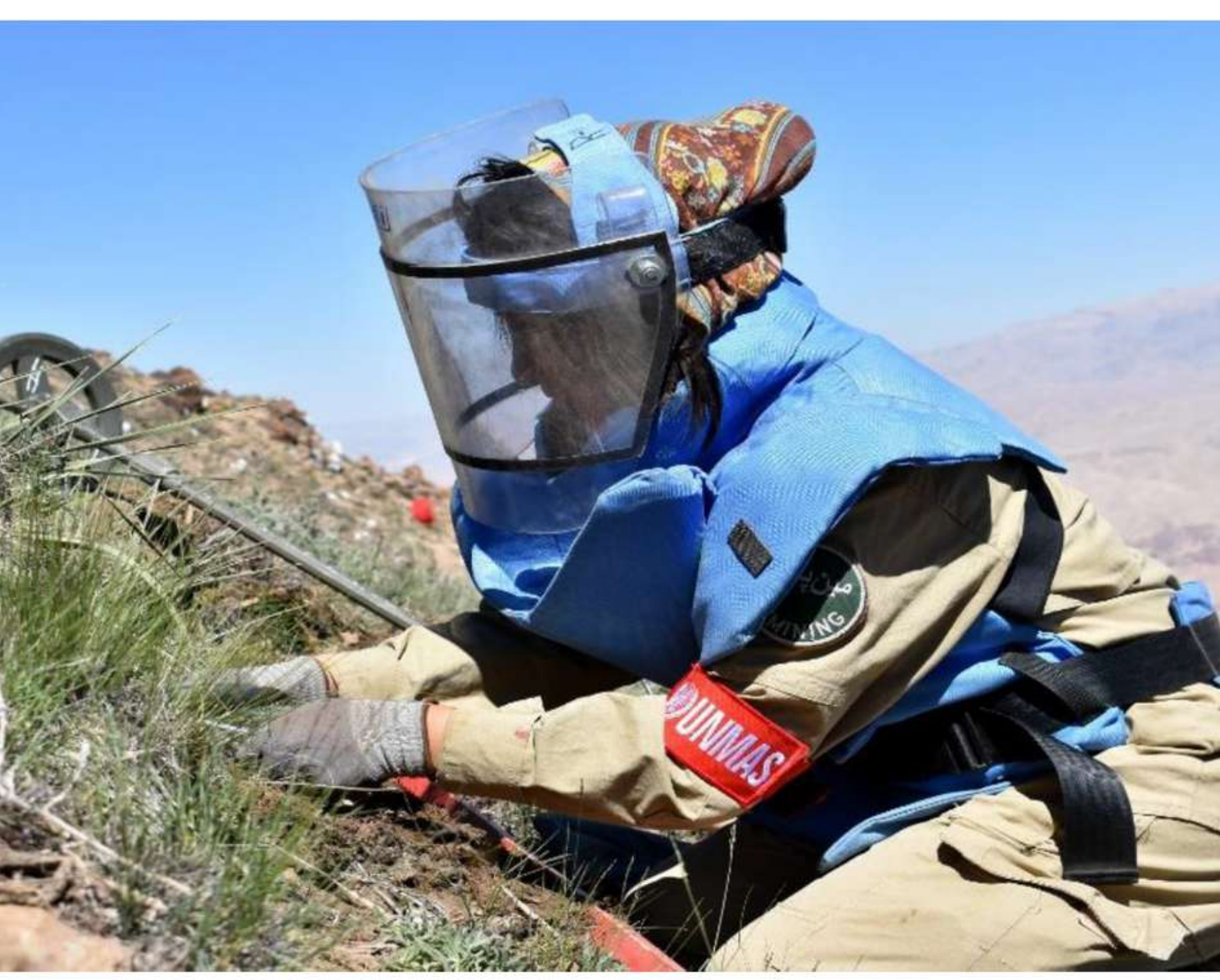
A deminer in Afghanistan.

Protecting People from Explosive Hazards in Humanitarian Emergencies: Promoting Inclusive, Local and Durable Solutions