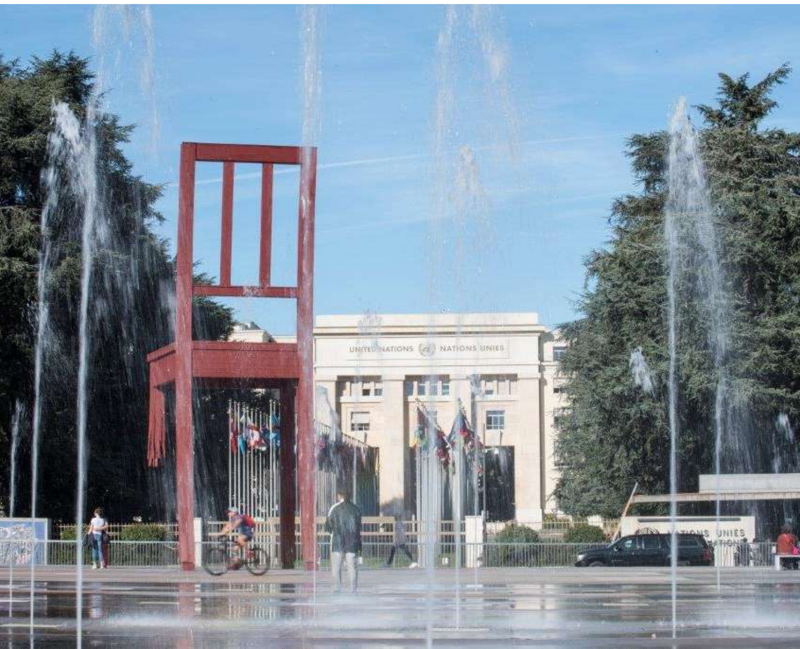
he 'Broken Chair', across from the United Nations Palais des Nations in Geneva, Switzerland.

Funding for protection responses must be scaled up, including through the mine action area of responsibility within the Global Protection Cluster.