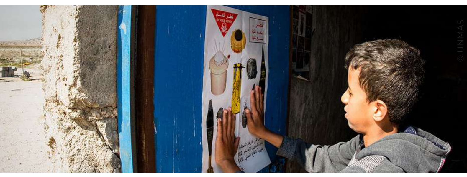
Mine Risk Education in Basra, Iraq.

The following principles guide the MA AoR and the implementation of the strategy: