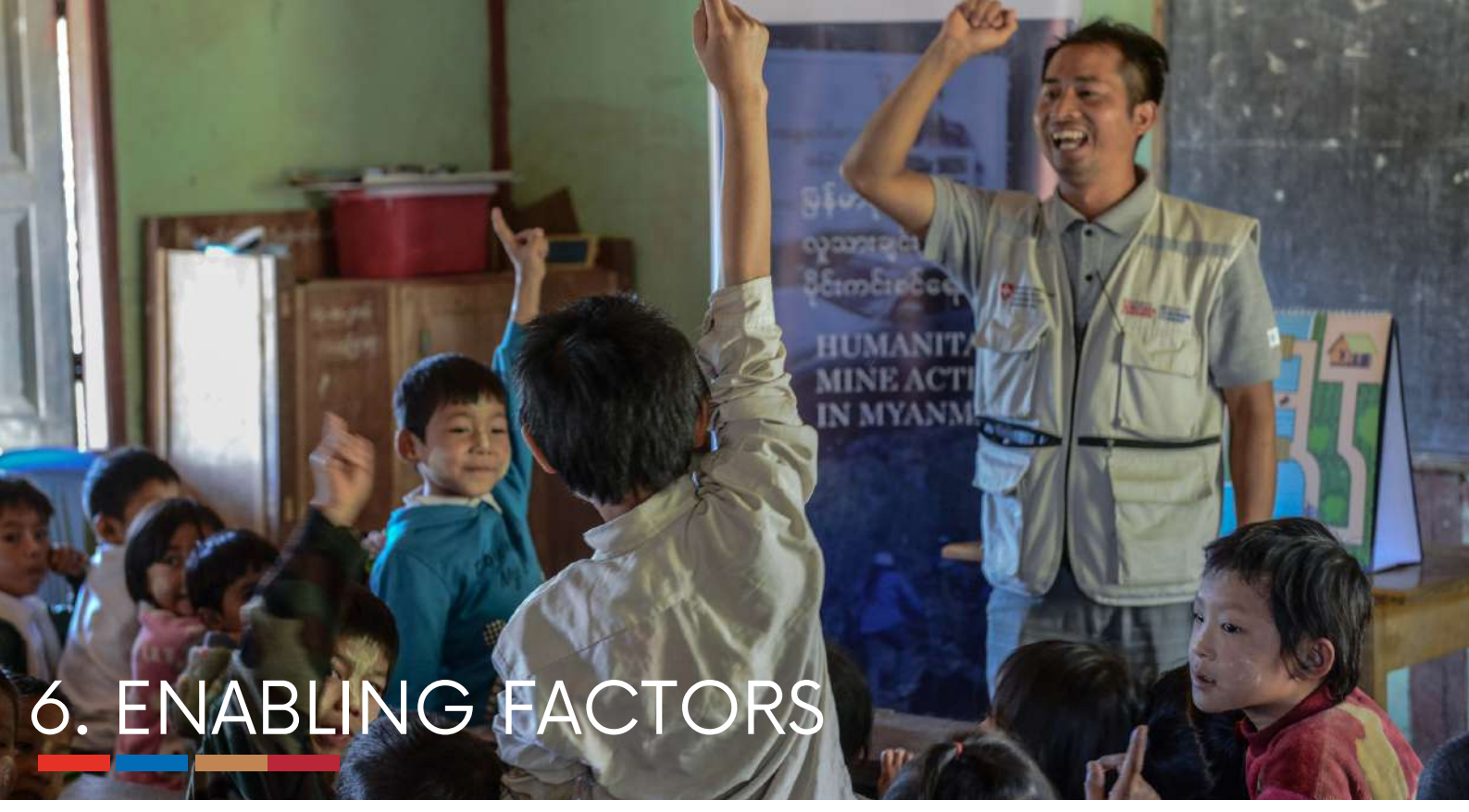
Mine Risk Education in Myanmar.

The global MA AoR is composed of organizations, which come together to deliver mine action in emergencies as effectively as possible.