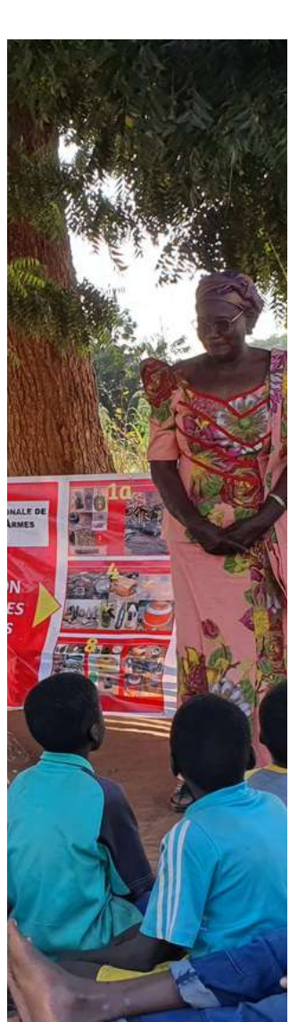
Association AMMIE conducts Risk Education session with a local community in Korsimoro, Burkina Faso. October 2021.

Strategic partnerships are key to promoting innovation and attracting new technical and financial resources for mine action. Fostering new and existing partnerships more proactively would support the MA AoR in responding to the rising mine action needs with adequate resources. The global MA AoR will strengthen its partnership strategy with Member States and donors, regional organizations, civil society, private sector and academia that can contribute to knowledge-sharing, learning, funding and innovation within the sector.