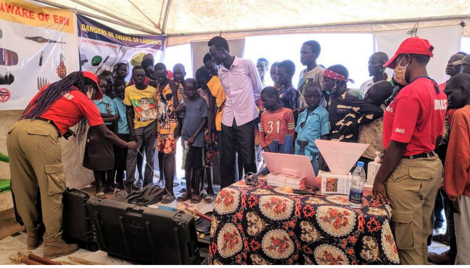
UNMAS EORE session in partnership with the Food and Agriculture Organization (FAO) in Warrap, South Sudan, November 2021.