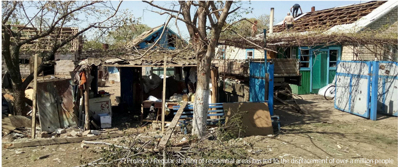
Regular shelling of residential areas has led to the displacement of over a million people

THE PROTECTION CLUSTER INCLUDES SUB-CLUSTERS ON CHILD PROTECTION, GENDER BASED VIOLENCE AND MINE ACTION