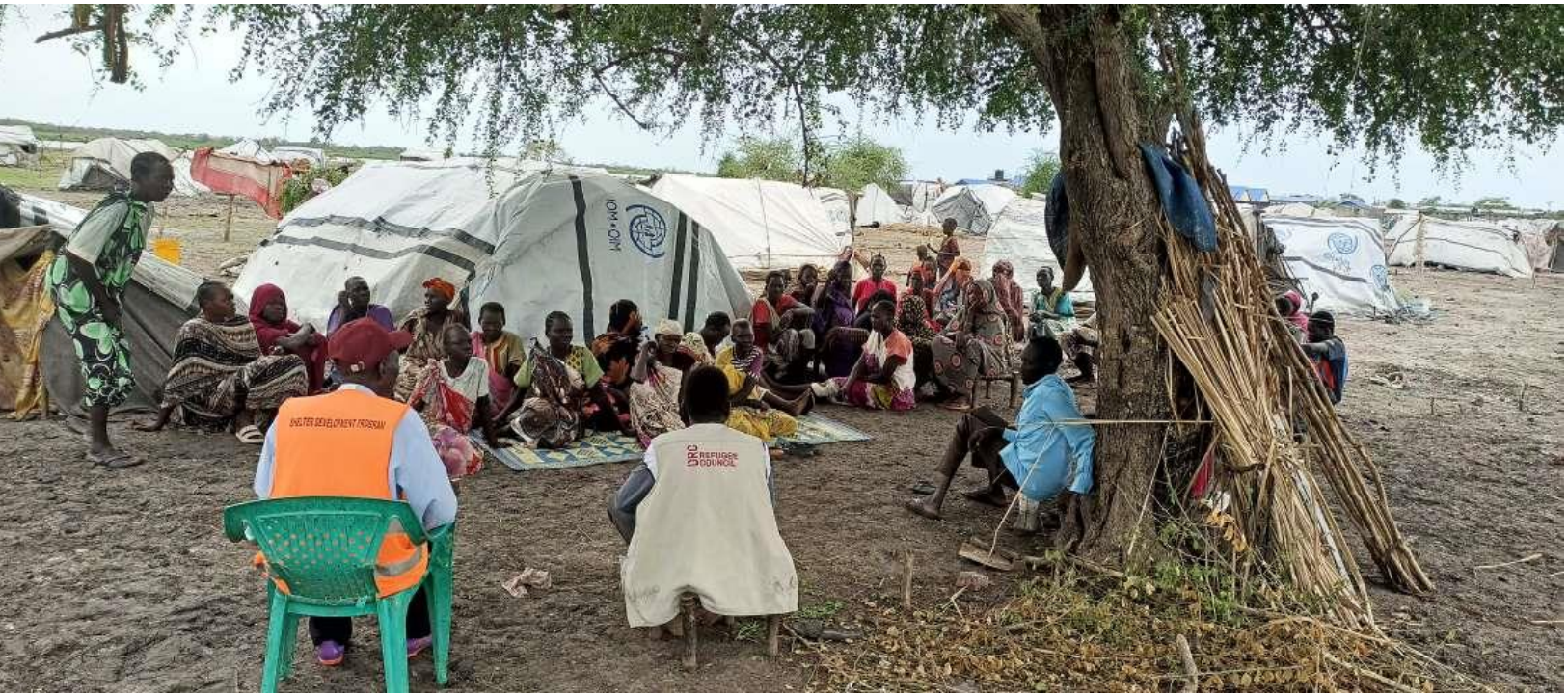
PHOTO: Protection Needs Assessment and Risk Monitoring activities conducted bt DRC in SSD.

The Protection Monitoring System (PMS) in South Sudan is managed by the Protection Cluster and it relies on contributions by member organizations to collect data via a Key Informant Interview (KII) questionnaire at payam level across eleven thematic areas thereby monitoring the occurrence of protection violations, their scale and impact on communities over time. In February 2024, protection monitors conducted 320 Key Informant Interviews (KIIs) covering 89 payams in 23 Counties in 6 States.