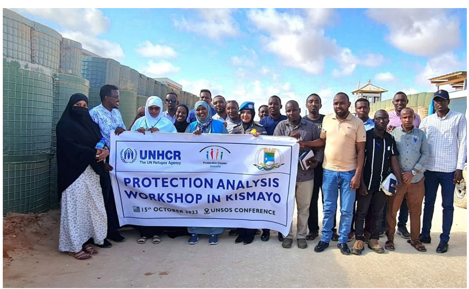
Participants of the joint analysis workshop in Kismaayo