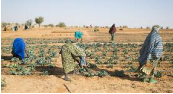
Nexus Approaches in Humanitarian Settings - A Guidance Note for the Protection Clusters (French, Spanish and Arabic Translations)