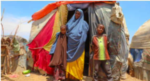
Housing, Land and Property in the context of Climate Change, Disasters and Displacement - Launch of Global Policy Brief with experiences from Somalia and Mozambique