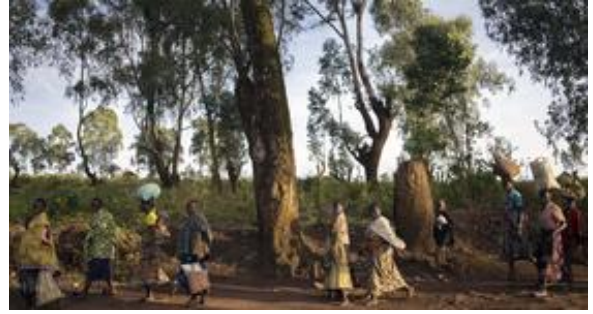
Access that Protects: An Agenda for Change (French, Spanish and Arabic Translations)