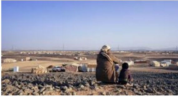
Protection Advocacy Toolkit