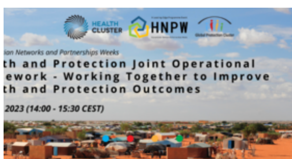
Health and Protection Joint Operational Framework - Working Together to Improve Health and Protection Outcomes