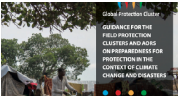
GPC Guidance for Field Protection Clusters and AoRs on Preparedness for Protection in the context of Climate Change and Disasters