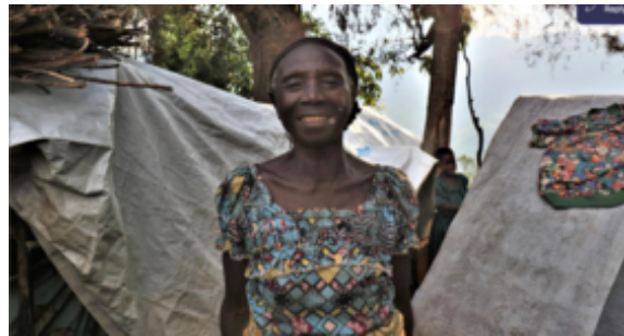
Stratégie du Cluster Protection en RDC 2023-2025