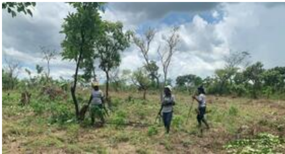
South Sudan Protection Cluster - Conflict and Food Insecurity - May 2023