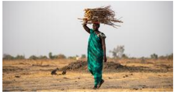
GPC Annual Report 2022