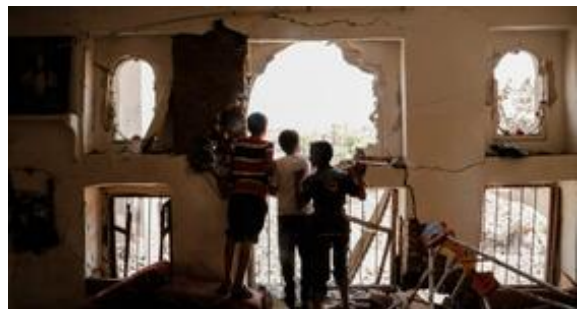
GPC PoC Advocacy Note - May 2023