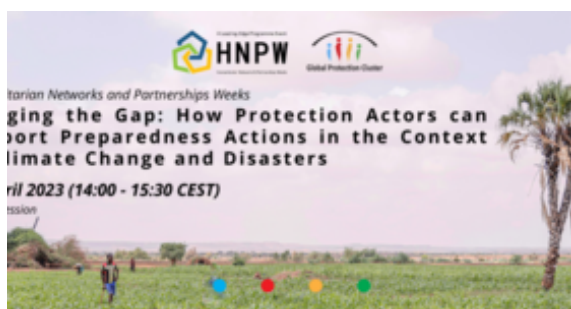
Bridging the Gap: How Protection Actors can Support Preparedness Actions in the Context of Climate Change and Disasters