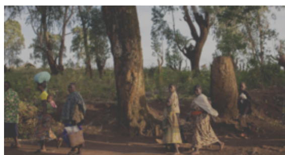
End of Year Event - Access that Protects: An Agenda for Change