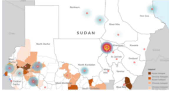
SUDAN Protection Hotspots and Conflict Events