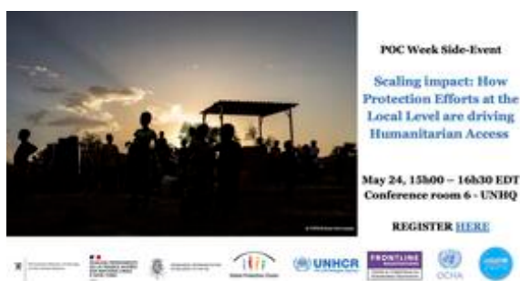
Scaling Impact: How Protection Efforts at the Local Level are Driving Humanitarian Access