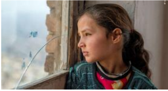
Afghanistan Protection Analysis Update