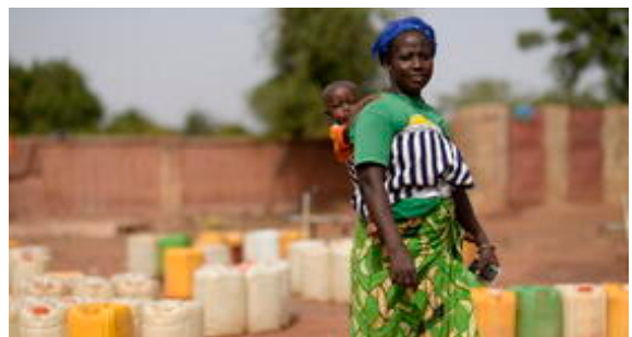
Burkina Faso Analyse de Protection