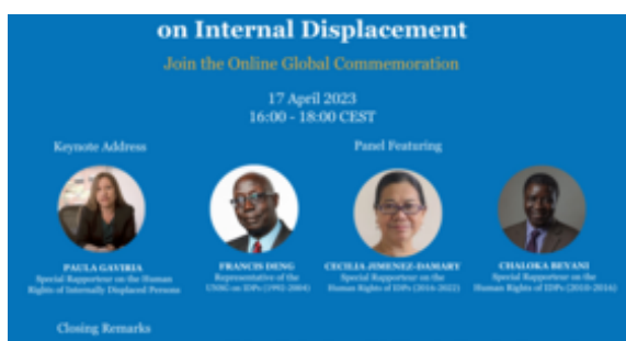
25th Anniversary of the Guiding Principles on Internal Displacement - Online Global Event