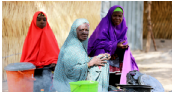
Participation of Internally Displaced Persons in Electoral Processes in North-East Nigeria