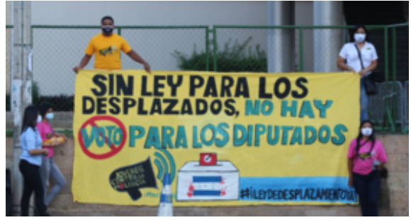
Global Report on Law and Policy on Internal Displacement: Implementing National Responsibility