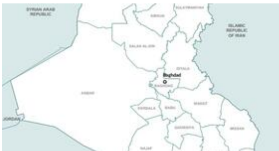
Snapshot Cluster Deactivation: Iraq Protection Cluster