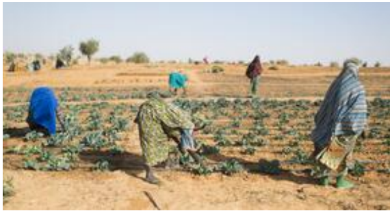
Nexus Approaches in Humanitarian Settings - A Guidance Note for the Protection Clusters