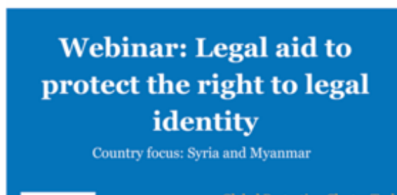
Legal Aid to Protect the Right to Legal Identity