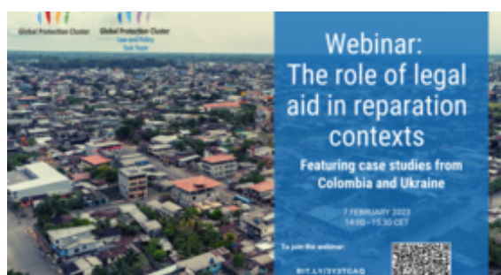
Webinar: The Role of Legal Aid in Reparation Contexts